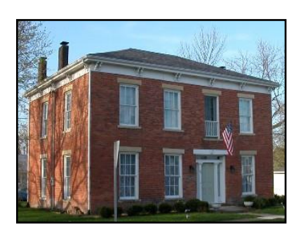
Visit our Website at www.historicmetamora.com

LOOKING BACK... Here's Christmas in Metamora over the years.