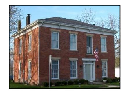
Visit our Website at www.historicmetamora.com