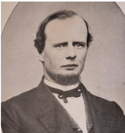
Stevenson Around Age 30