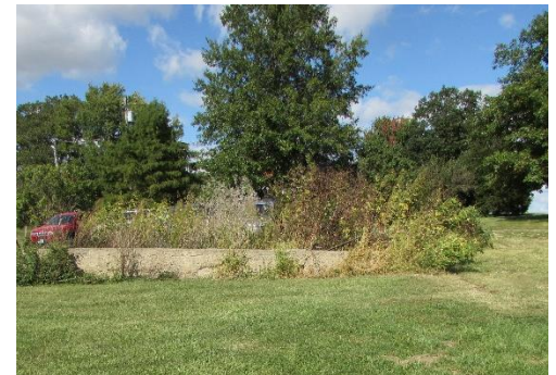
The remaining foundation of the Morse home, an important stop on the UGRR.

UNDERGROUND RAILROAD BOOK IN METAMORA AVAILABLE – It's a fascinating account – and little known - that details the significant participation of Metamora area abolitionists in the Underground Railroad – in their own words!! You can pick up a copy ($10) at Commerce Bank, the Metamora Library, Timeless Treasures (east side of the Square) – or we'll send you one if you send your name and mailing address to Metamora Association for Historic Preservation, PO Box 264, Metamora 61548. Be sure to include your name, mailing address, and a check payable to Metamora Association for Historic Preservation for $15. Thanks!