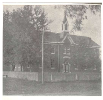
School which stood opposite church from 1890 to 1923.