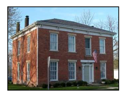
Visit our Website at www.historicmetamora.com

To Promote and Preserve Metamora's History Metamora Association for Historic Preservation Chartered Sept. 21, 2000 Illinois