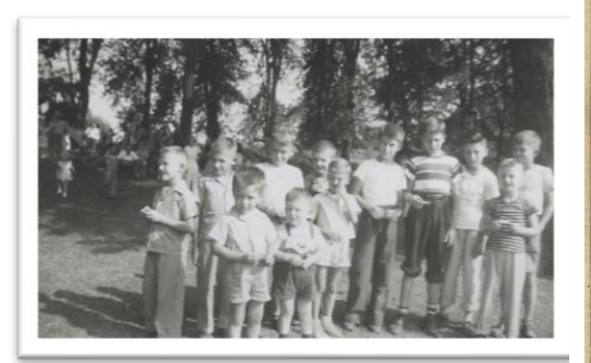
St Mary's Picnic - 1947