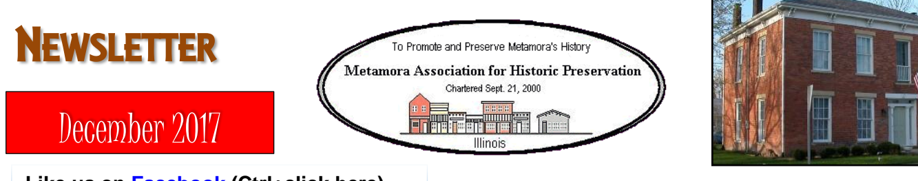
Visit our Website at www.historicmetamora.com