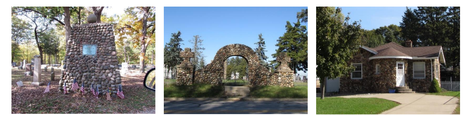
Oakwood Cemetery Veteran's Memorial 1923