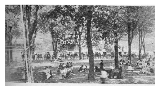
1902 Old Settlers Picnic. Note tower structure at left which held the Fire Call bell.