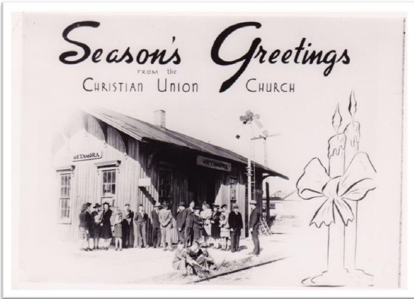
Picture taken in front of Metamora Railroad Depot about 1913.