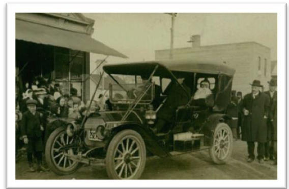
Santa Visit - 1910