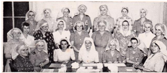
SURGICAL DRESSING CLASS