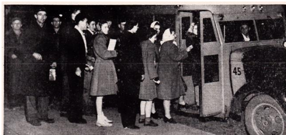
EARLY MORNING SHIFT ENROUTE TO PEORIA WAR INDUSTRIES