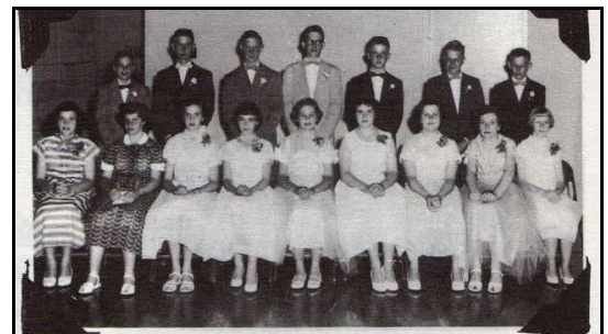
1953 GRADE SCHOOL GRADUATING CLASS